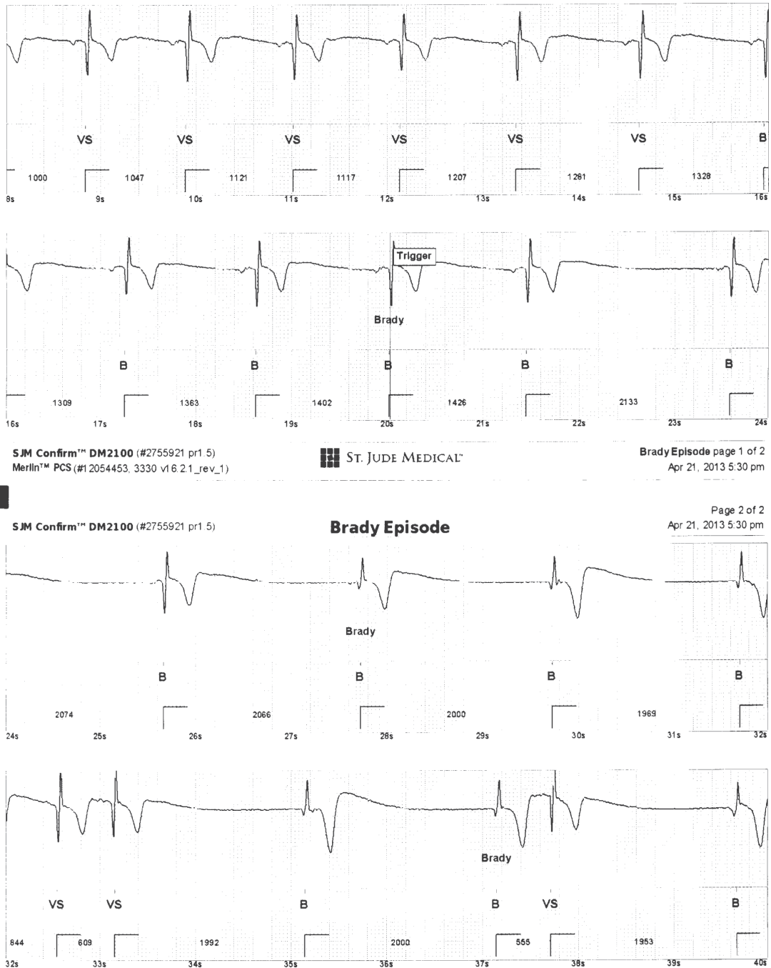
FIGURE 1. ILR tracing during syncope demonstrated a gradually decrease of the heart rate with sinus pause followed by a slow junctional rhythm (29 bpm).

Careful tracing analysis demonstrated a gradual decrease of the heart rate with sinus pause followed by a slow junctional rhythm (Figure 1). This rhythm pattern was probably related to a neutrally-mediated reflex mechanism as the possible cause of syncope.