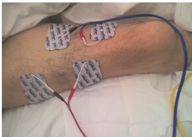
FIGURE 1. Application of neuromuscular electrical stimulation (NMES) for quadriceps muscle contraction of ICU patients. ICU = intensive care unit.

Neuromuscular electrical stimulation is a treatment tool which is widely used by physiotherapists for pain relief, 8 muscle training, 9 wound healing and other patient conditions, 10,11 as well as in healthy subjects. 4 NMES may be applied not only by clinicians but also by patients themselves in home-based rehabilitation programs. 11 According to the literature, each