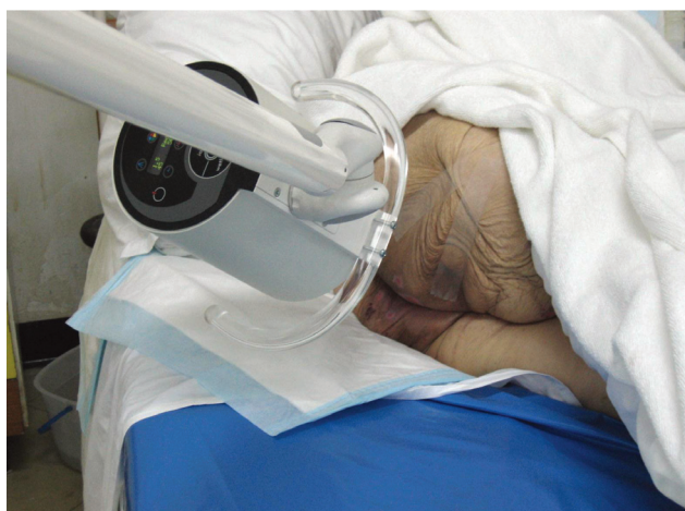
FIGURE 3. Application of wireless electrical stimulation in a sacral pressure sore.

histochemistry assays have illustrated abundance of thick collagen fibres and focal increase of mast cells. According to the authors, the rapid progress of wound healing in the above patient using WMCS seems very promising and the method indeed very effective. 46 According to the above data there is not enough evidence to substantiate the wide use of WMCS. However more research in this area is necessary.