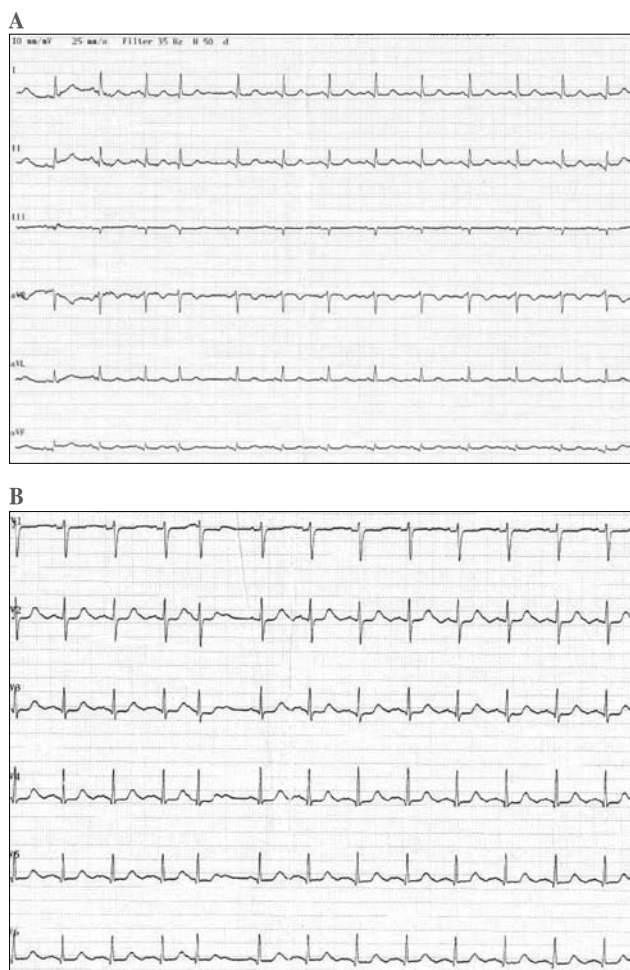
FIGURE 4. ECG after chest tube insertion.

the inferior leads compatible with an old myocardial infarction. This was excluded particularly with the echocardiogram, which showed no regional wall motion abnormalities. The ECG changes returned to baseline after removing the air