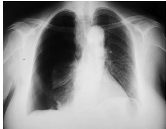
FIGURE 2. Chest X-Ray showing right pneumothorax.

The first case of ECG changes associated with spontaneous pneumothorax was described in 1928 (3). Walston and Brewer described the following ECG changes with pneumothorax: