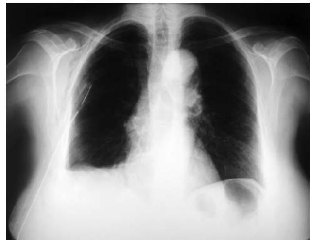
FIGURE 3. Chest X-Ray showing right lung expansion after evacuation of the air.

diminution of amplitude of precordial R waves, inversion of precordial T waves, diminution of QRS amplitude and rightward shift in the frontal QRS axis (4). Numerous cases of mostly left-sided pneumothorax causing transient, ischemic-type ECG changes that could lead to diagnostic and therapeutic difficulties have been reported since then. Similar ECG changes have been rarely reported with right-sided pneumothorax (5,6). Recently, Monterubio et al, described a case of iatrogenic, bilateral pneumothorax with a decrease in QRS amplitude and loss of R wave voltage in the precordial leads which returned to baseline after right pleural cavity evacuation (7).