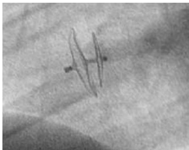
FIGURE 1. Fluoroscopic appearance (left anterior oblique-LAO projection) of a PFO closure device with the two disks held together via a thin trunk, deployed, the smaller one in the left atrium, and the larger one in the right atrium, bringing in contact (close apposition) the two membranous parts of the interatrial septum. Complete closure with impermeability from full endothelialization is achieved within 3-6 months.

Another large group of patients undergoing percutaneous closure of an interatrial communication are those with an ASD. The majority of these patients, at least those having defects as large as 35-38 mm and an adequate rim to support a closure device, can now be successfully submitted to the percutaneous technique and thus avoid surgery. 42-44 Certainly, these patients could also suffer from cryptogenic strokes and migraine, however, most of them usually require intervention because of hemodynamic reasons such as large right-to-left shunting (Qp/Qs >1.5:1.0) leading to right ventricular dilation and dysfunction. Intervention has to occur