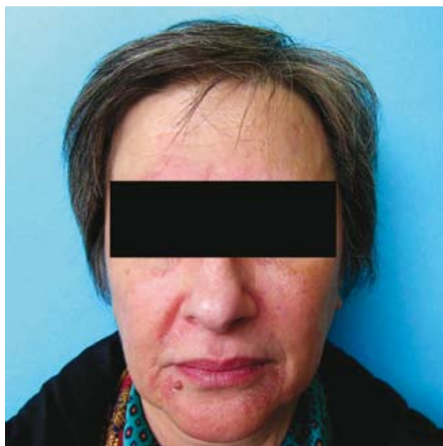
FIGURE 1. Clinical aspect of pimecrolimus-induced rosacea-like demodicosis.

Topical pimecrolimus, a representative of macrolactam immunomodulators, is an effective and safe second-line modality for the short-term and intermittent management of non-immunocompromised patients with atopic and seborrheic dermatitis and other dermatoses unresponsive to, or intolerant of other treatments 5-7 . Its side effects include transient local skin reactions (burning/tingling, erythema, pruritus), increased incidence of mostly viral cutaneous infections and lymphadenopathy 5 . The patient presented herein had received no systemic or topical medications for treatment of the last exacerbation of her seborrheic dermatitis prior to the initiation of pimecrolimus. Thus, in view of the morphology of the cutaneous manifestations, the identification of numerous Demodex mites in skin scrapings and in the hair follicles and