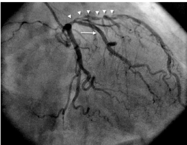
Figure 3. RAO caudal projection: LAD diffuse severe disease starting at its ostium and extending to the proximal and middle segments is noted (arrow heads). A proximally originating large diagonal with ostial stenosis is also implicated (arrow).

A Judkins right-4 6French guiding catheter was selected,