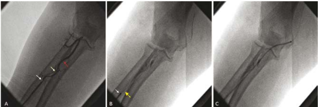
Figure 2. A. Three consecutive stenoses of the radial artery (arrows). The first is just after the sheath tip (white arrow). B. Successful crossing with a 0.014" coronary guidewire (white arrow: catheter tip, yellow arrow: sheath tip). C. Diagnostic catheter advancement over the 0.014" guidewire.

angiography. Two vessel disease was documented; after a short left main the LAD was calcified with diffuse severe disease starting from the ostium and extending to the proximal and middle segments, while a large diagonal branch originating from the very proximal LAD was also affected at the ostium (Figure 3). These lesion characteristics were consistent with the previous recommendation for surgical treatment. However, a total occlusion of the proximal right coronary artery (RCA) was the culprit lesion (Figure 4A).